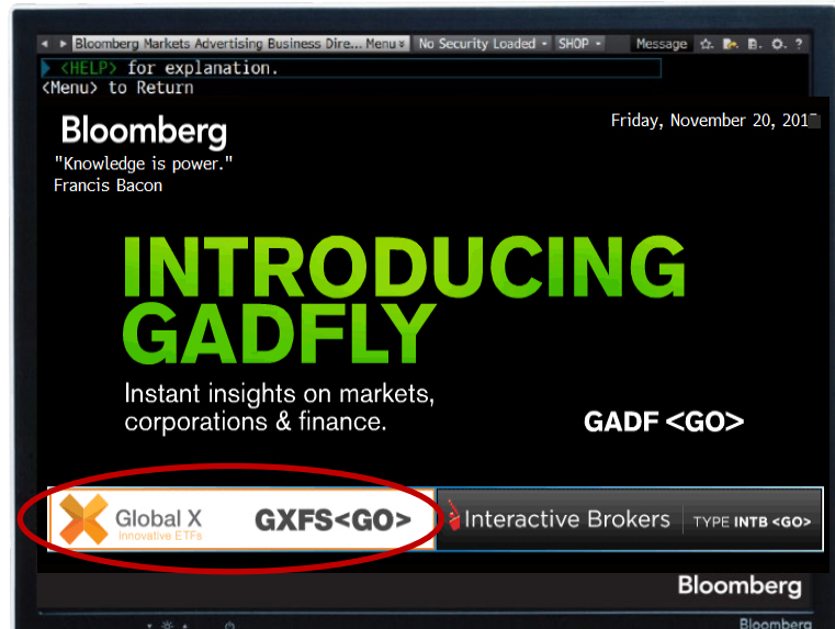
Half login banner ad