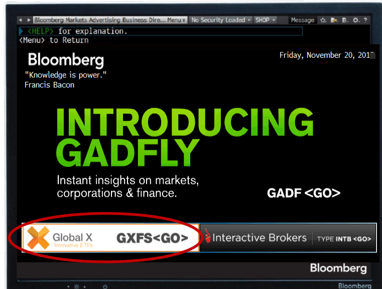
Half login banner ad