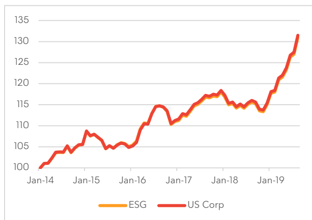
Historical Index Values (rebased) - ESG vs US Corp

The Bloomberg SASB US Corporate ESG Index is an investment grade, fixed-rate, U.S. dollar-denominated benchmark that uses R-Factor™ scores by State Street Global Advisors® to tilt issuer allocations above or below their baseline market weights. Based on the Bloomberg Barclays US Corporate Index, the ESG index contains the same securities as the US Corporate Index except for issuers without a score, but reweights all index-eligible issuers to increase the overall R-Factor score of the index. The index was launched in September 2019, with history backfilled to February 2014.